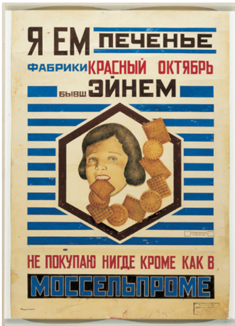
Aleksandr Rodchenko and Vladimir Mayakovsky, Advertising poster for Red October cookies, 1923

Benjamin imagined that the dreaming collective of bourgeois culture would awaken from the “dream sleep” of the commodity phantasmagoria into a socialist culture, when the wish-images of what he called the “ur-past” -- the mythic, egalitarian society of material abundance -- are made visible in the newest technological forms. Wish images of the harmonious ur-past had left their traces embedded in the mass material culture of the recent, outmoded past -- for him, in the material culture of the arcades, in the past of his grandparents -- and would have to be redeemed in the new material forms of modernity in order to engender a socialist future. [19] Rodchenko and Mayakovsky’s designs carry out Benjamin’s prescription to the letter: they refer to the traces of the recently outmoded past -- the old-fashioned engravings of industrial machinery on the “Our Industry” caramel box, for example, or the little girl from the prerevolutionary Einem poster -- and attempt to awaken them by citing Constructivist objects like the hexagon encircling the Red October girl, taken from the form of one of Rodchenko’s geometric Spatial Constructions of 1920-21, and the overall modernist graphic form itself, into the “now” of Mossel’prom.