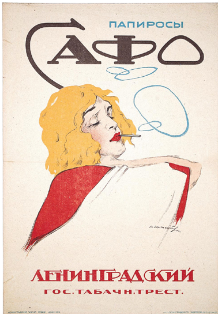
Aleksandr Zelenskii, Advertisement for Sappho cigarettes, 1924

sexuality in favor of a more explicit depiction of the oral drive. The Constructivist ads seem to say that the objects of mass industrial culture have a powerful hold on the human subject, but the difference between capitalism and socialism is that under socialism the nature of that hold will be articulable to the subject, even if it cannot be immediately altered or overcome. The Constructivist drive toward transparency was not just material, as in the systematic Spatial Constructions of Ioganson and Rodchenko, or Popova's easy-to-make flapper dress, but psychological, offering a critical understanding of the excessive nature of consumer desire – the “flash of recognition” – that would be necessary for waking up from the commodity phantasmagoria of capitalism. It is this transparency of object desire that the Rodchenko-Mayakovsky advertisements map out, contravening Peter Bürger's well-known claim that when avant-garde art enters into life as a form of mass culture, “it is an art that enthralls.” [21]