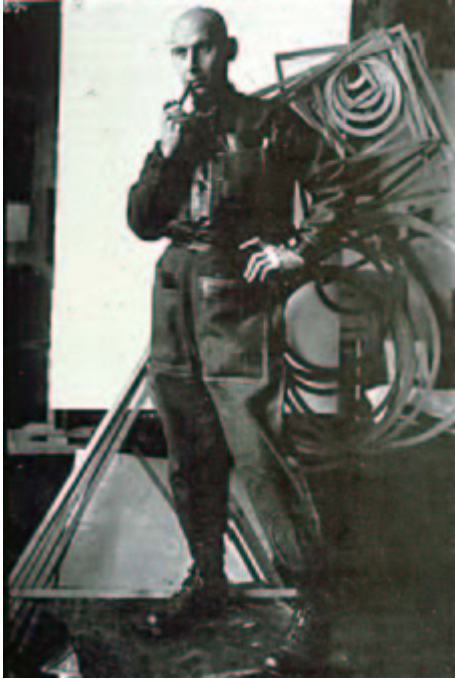
Mikhail Kaufman, Aleksandr Rodchenko, 1922