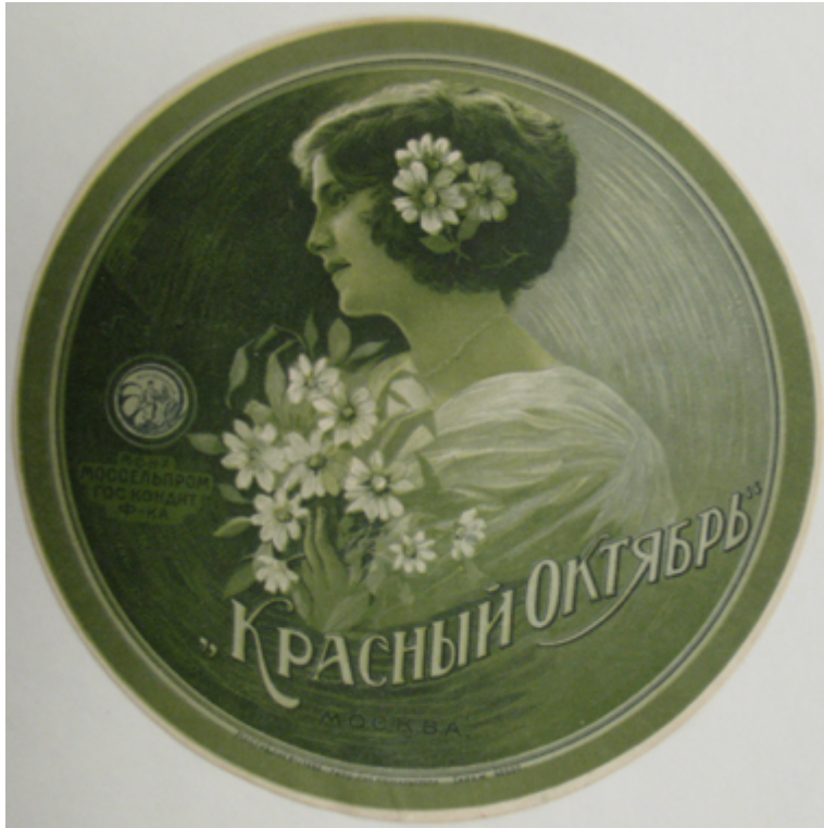
Anonymous, Red October advertising image, ca. 1922

which will use the most advanced technological forms of industry to amplify the sensory experience of its human user, and awaken him or her from the dream sleep of the commodity phantasmagoria. But in the moment of NEP, the Constructivists adjust to the reality principle that the large-scale production of such objects is not yet possible and concentrate their graphic efforts on laying bare the processes of object desire at their most originary, bodily level. Their advertisements are “transitional objects” that explore the transition from the fetishistic capitalist desires fomented by the commodity to the equally strong, but now explicit and comprehensible desires for the semi-socialist objects of NEP – an exploration that will eventually result in fully organized desires for socialist objects themselves.