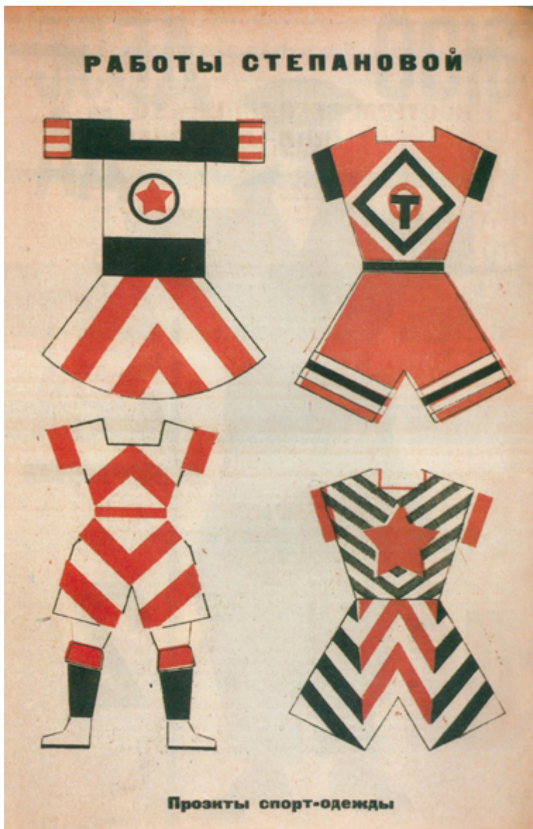
Varvara Stepanova, Designs for sports clothes, 1923

Walter Benjamin, preeminent theorist of mass culture and socialism, asked optimistically in his Arcades Project : “Does fashion die (as in Russia, for example) because it can no longer keep up the tempo?” [13] His question implies that only the tempo of actual social change brought about by revolution can obliterate the lure of fashion’s endless cycle of novelty. Yet an editorial in the first post-revolutionary issue of the women’s magazine Zhurnal dlia khoziaek ( The Housewives’ Magazine ) in 1922 declared in ringing tones: “our readers may think that fashion has died out . . . but our old friend fashion, powerfully ruling the female half of the human species, had no intention of dying!” [14] The many elegant Parisian dress patterns published in Soviet women’s magazines like The Housewives’ Magazine were directed at women buying fabric and then sewing at home or ordering dresses from small workshops. The mass production of clothing had been almost nonexistent in prerevolutionary Russia, and the idea of cheap, factory-produced stylish clothing that would be available to everyone was still largely utopian, given the primitive state of Soviet clothing production.