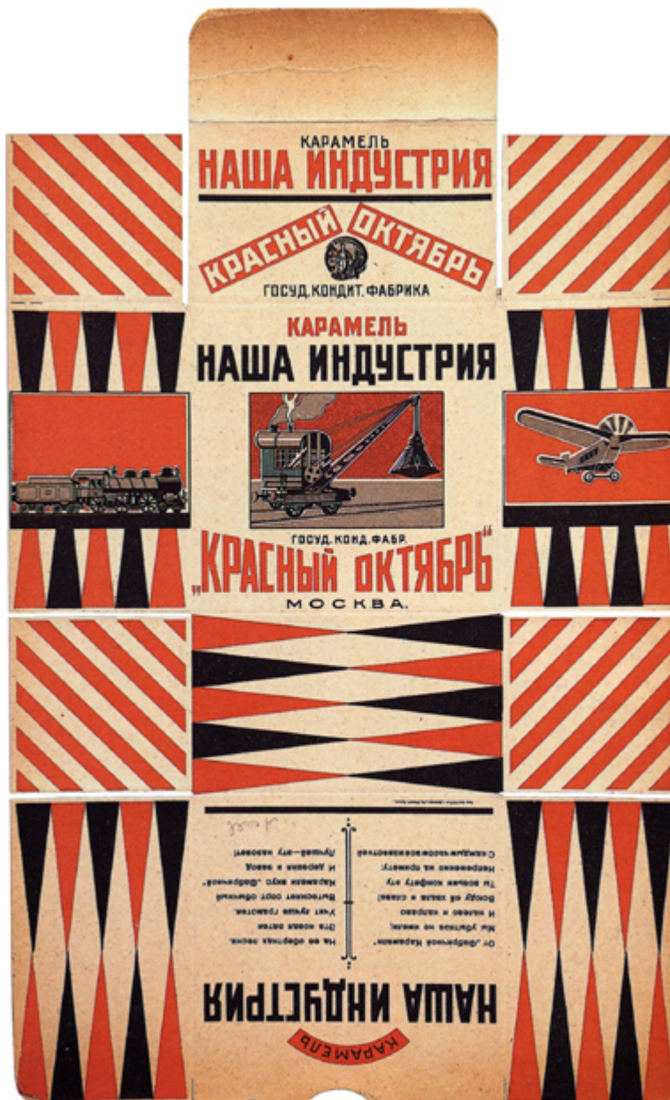
Aleksandr Rodchenko and Vladimir Mayakovsky, Box for Our Industry caramels, 1923