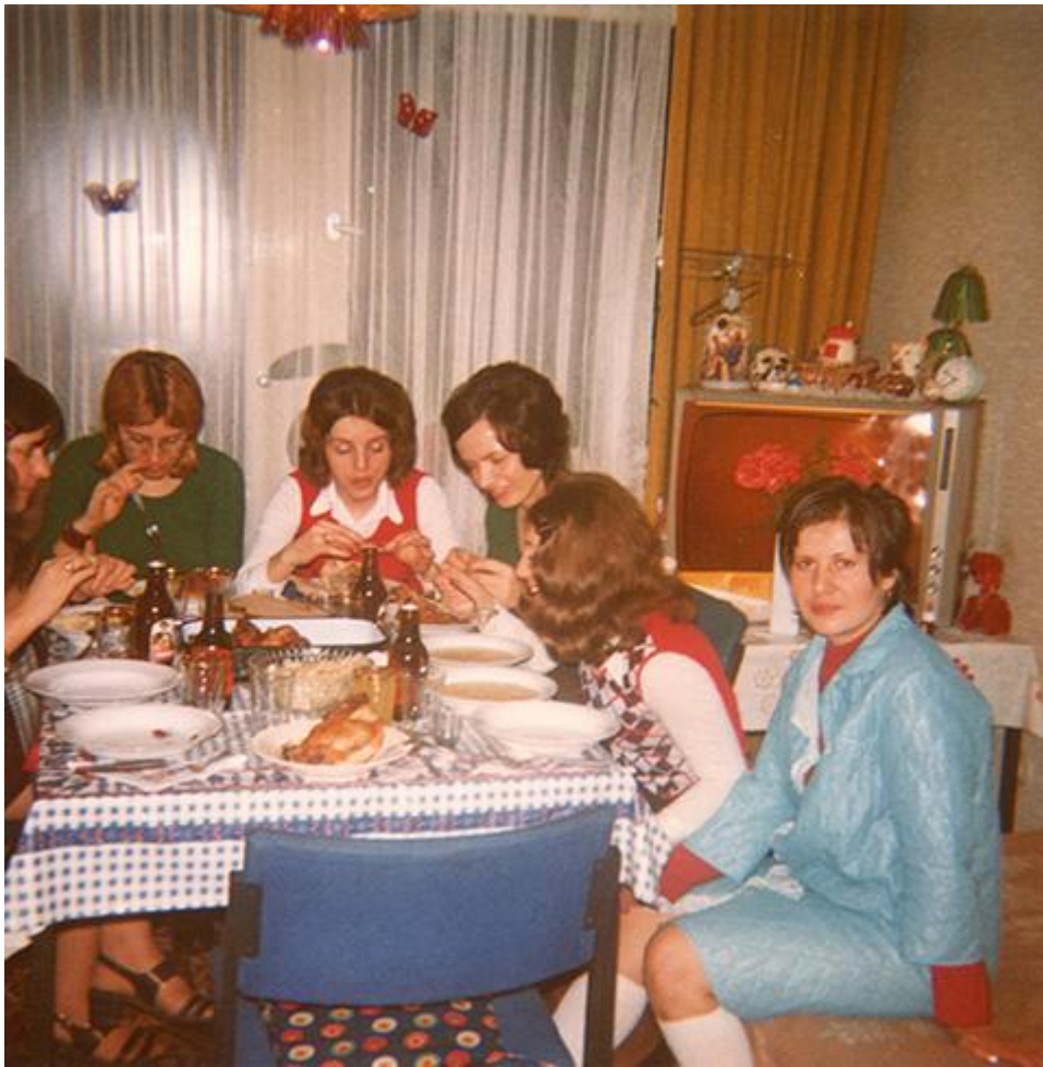
Inside the guest workers' dorm. Color photograph.