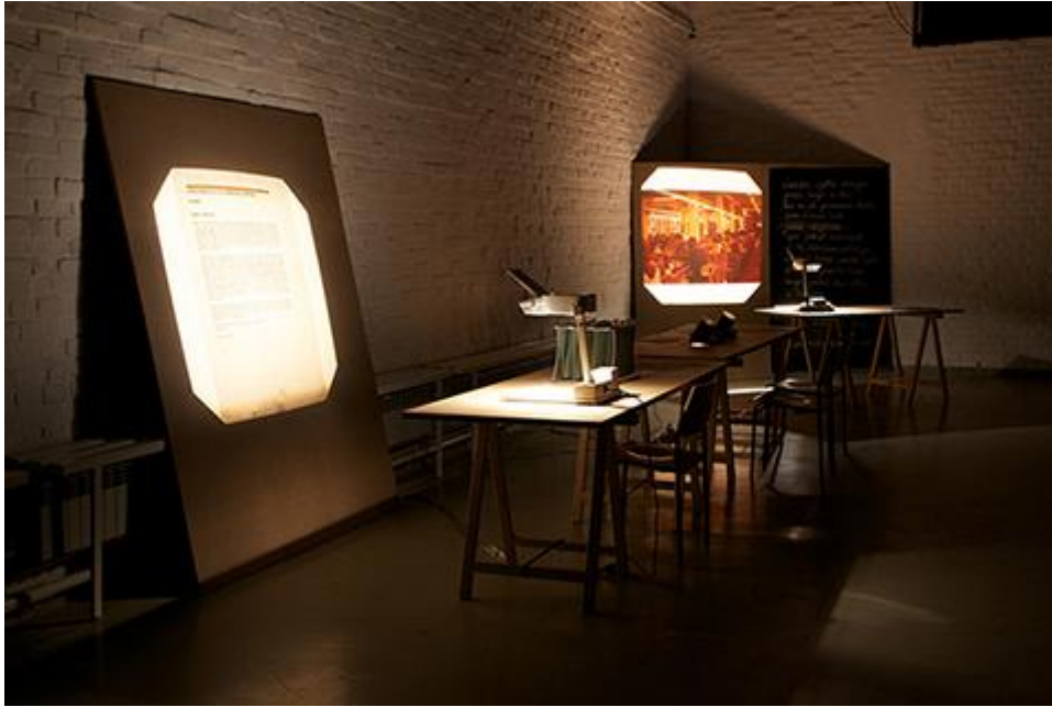
GUESTures exhibition, installation view, SC Gallery, Zagreb, 2011.

Back in London, I joined a group called Implicated Theatre , where we learn, devise, and use Theatre of the Oppressed techniques and methods developed by Augusto Boal, Brazilian radical theater director. 2 I also became interested in the method of "reenactment," which is often used in live reconstructions of historic events, often of a military nature by amateur enthusiasts. Contrary to the grandness of these large events, I was drawn to the intimate, mimetic potential of reenactment as used in verbatim theater, often to re-stage marginalized stories or public enquiries such as in the plays I saw at the time, Tactical Questioning: Scenes from the Baha Mousa Inquiry by Nicholas Kent and London Road by Alecky Blythe . Clio Barnard's film The Arbor was highly influential. It used actors to lip sync the voices of real people. Each of these works questioned documentary's aspiration to collapse the distance between reality and representation while simultaneously not losing the political urgency or veracity of the document. The verbatim method offered a way of working with the material, whereby its inconsistencies, its "truth" is not ironed out and the messiness of