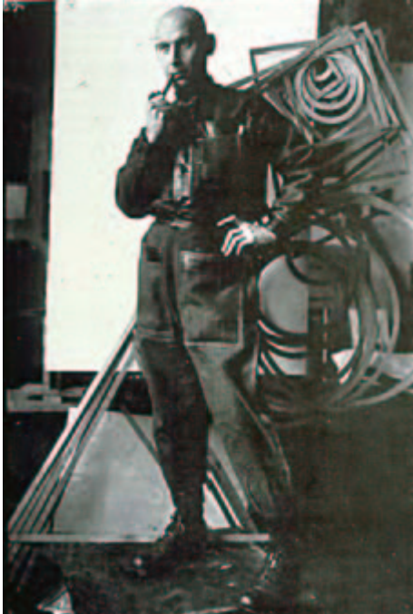
Mikhail Kaufman, Aleksandr Rodchenko, 1922