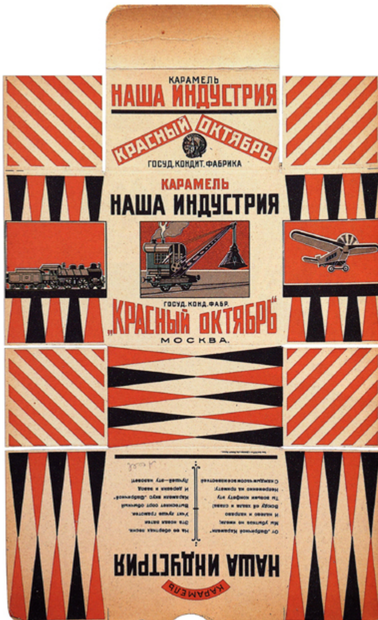
Aleksandr Rodchenko and Vladimir Mayakovsky, Box for Our Industry caramels, 1923