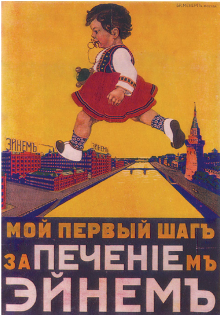
Menert Brothers, Advertisement for Einem cookies, early 20th century.